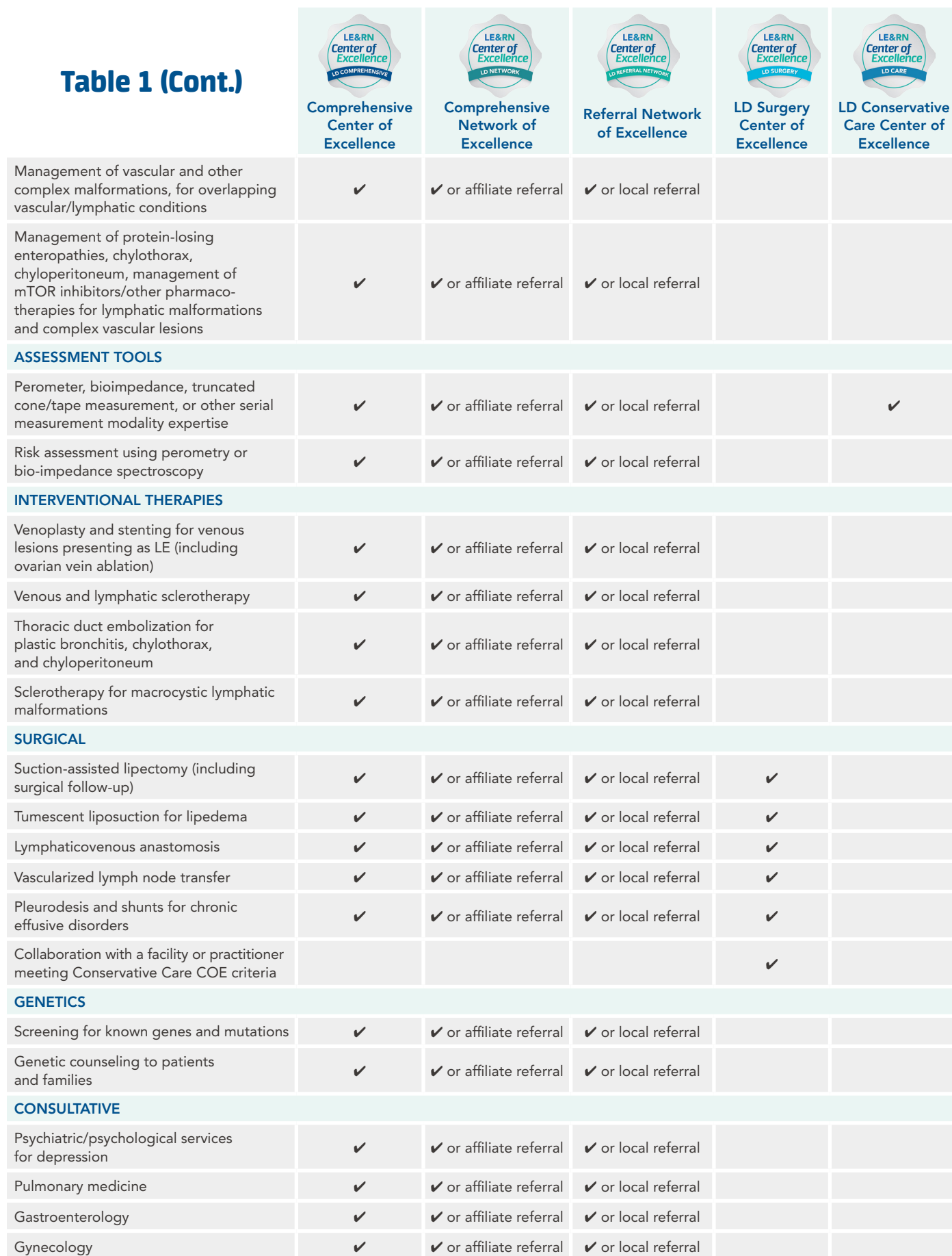
Table 1 (Cont.)