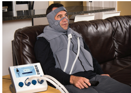
HEAD AND NECK