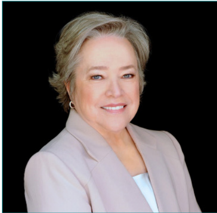
Academy Award-winning actress Kathy Bates, LE&RN's spokesperson.

"I'm KATHY BATES. I had a double mastectomy and as a result I have lymphedema in both arms. If we want to win this fight against lymphedema and lymphatic disease, we need to stand together and educate the world. Join me. I urge you to become a member of LE&RN."