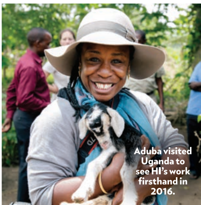
Aduba visited Uganda to see HI's work firsthand in 2016.