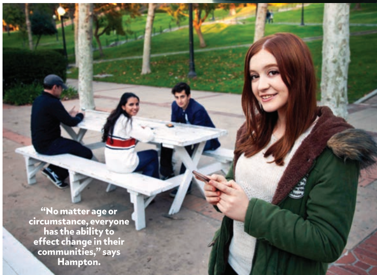
"No matter age or circumstance, everyone has the ability to effect change in their communities," says Hampton.