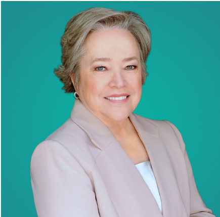
Academy Award-winning actress Kathy Bates, LE&RN's spokesperson.

"I'm KATHY BATES. I had a double mastectomy and as a result I have lymphedema in both arms. If we want to win this fight against lymphedema and lymphatic disease, we need to stand together and educate the world. Join me. I urge you to become a member of LE&RN."