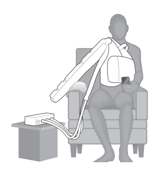
Pneumatic compression pump

Another treatment option is pneumatic compression pump therapy . In this therapy, a garment is worn over the area of the body affected with lymphedema. Inside the sleeve or vest are multiple chambers, like balloons. A pump is attached to the garment. It inflates the chambers