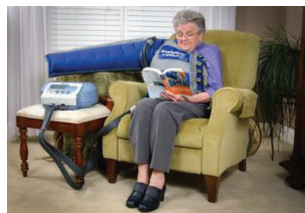
Pneumatic compression pump

Another treatment option is pneumatic compression pump therapy . In this therapy, a garment is worn over the area of the body affected with lymphedema. Inside the sleeve or vest are multiple