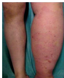
Left leg lymphedema

Call your physician's office if you have any of these signs of lymphedema near the area affected by surgery or cancer.