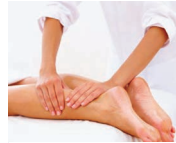
Gentle massage technique

When the swelling is mild, treatment is aimed at helping lymph flow away from the swollen area. Compression garments, exercise, and elevation are used to help lymph flow. This is usually effective in Stage 0 and Stage 1 lymphedema.